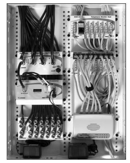
Sample configuration for telephone, audio/video, security and Ethernet.

For More Information about FastHome™ and Fast Media Home Network Systems, contact: